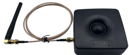
Optionally available with an external antenna