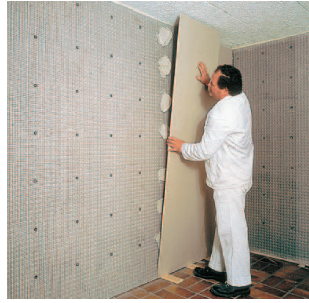
DELTA®-PT forms a waterproof, reliable support for plaster and render coats or plasterboard panels.