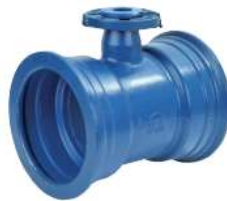
Example of NATURAL range fitting