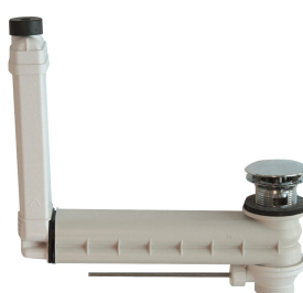
Drain and overflow set