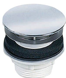
Dome waste valve