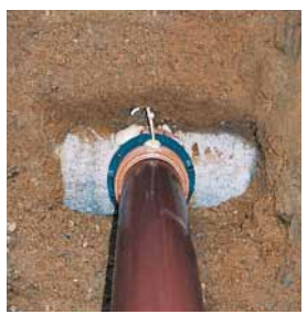
Junction is installed in a concrete pipe connecting a DN 160 mm diameter HS-Pipe Sewer.