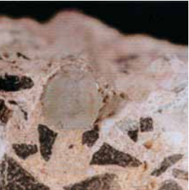
Steel surface below the expansion resin layer in an immersion trial.