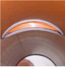
Correct installation of the junction.