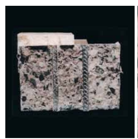
Cross section through a test piece.