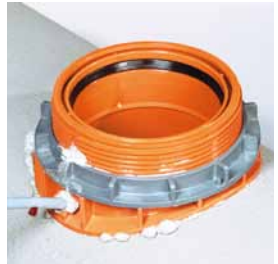
With a cartridge and a mixing tube, the resin can be filled in directly via the filling opening in the distance ring.