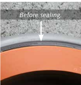
Junction is in the right position but not compressed.