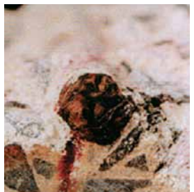
Unprotected steel surface subjected to an immersion trial.