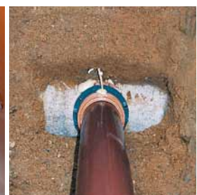
Junction is installed in a concrete pipe connecting a DN 160 mm diameter HS-Pipe Sewer.