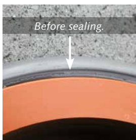
Junction is in the right position but not compressed.