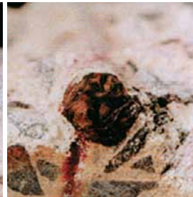
Unprotected steel surface subjected to an immersion trial.