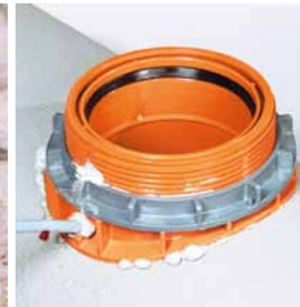
With a cartridge and a mixing tube, the resin can be filled in directly via the filling opening in the distance ring.