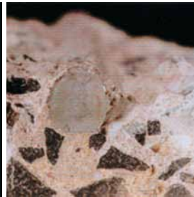
Steel surface below the expansion resin layer in an immersion trial.