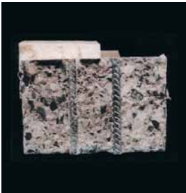
Cross section through a test piece.