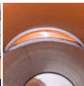
Correct installation of the junction.